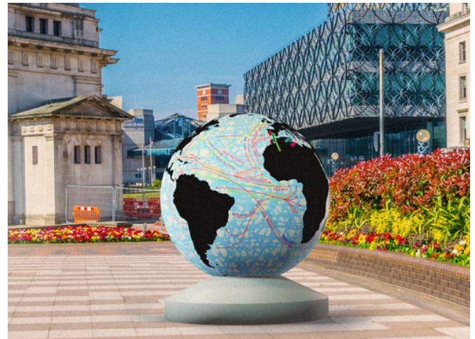
'The World Reimagined', 2021, Founding Artist Yinka Shonibare CBE

Submitted designs will be considered by the Open Call Jury.